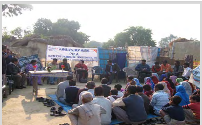
USAID partner World Vision works regularly with men and women in self-help groups in agricultural production.