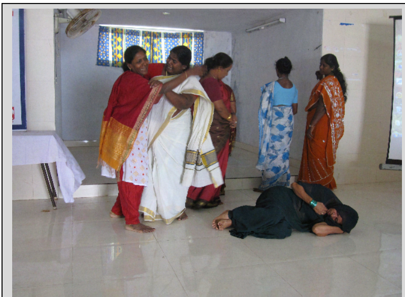
Community-based commercial sex workers in Mahabalipuram perform a skit on the impact of HIV in their communities.

many opportunities to strengthen prevention, treatment, care and support interventions by ensuring inclusion and equity for marginalized populations who are most at risk of HIV (key populations) or are living with HIV (PLHIV). In fact HIV/AIDS has in a way promoted a more complex understanding of gender and gender inequalities and stimulated efforts to address structural factors that shape social relations and marginalization. 92