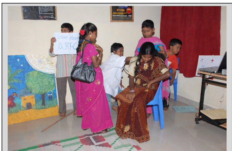
Children act in a play about HIV-affected households.

The AIDS Prevention and Control project (APAC), based in Chennai, works in a wide variety of ways and with varied partners on HIV prevention, testing, treatment and care. A long-standing project of the Voluntary Health Trust, APAC has enormous capacity and could be an excellent partner for working on gender. Reflecting the National AIDS Control Organization's (NACOs) commitment to working with high-risk groups, APAC has worked with these groups and has been a model for other organizations throughout the