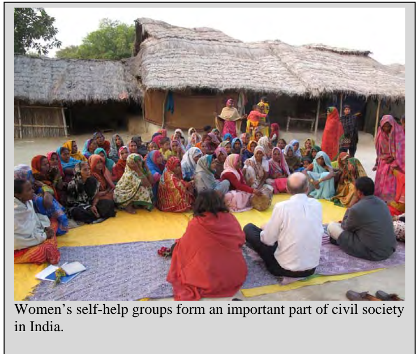
Women's self-help groups form an important part of civil society in India.

Some of the initiatives taken by SEWA include organizing women agriculture workers/farmers in Sabarkantha, Gujarat to undertake watershed development and reclaim 3,000 hectares of ravine land on which 1,17,700 saplings are planted every year. Tree-grower societies are formed for setting up nurseries and have a license to distribute seeds. Women are organized into SHGs and trained in leadership development, awareness generation, and capacity building. In Vadodara District women's groups have treated and converted 2,000 hectares into productive land.