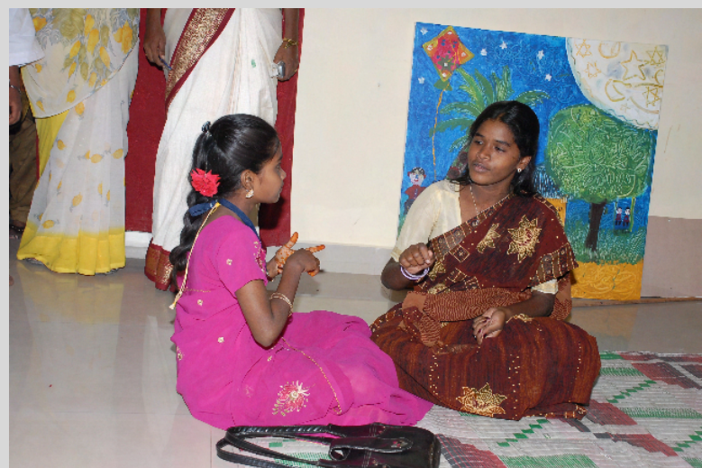
Two girls play the role of a family member and a social worker in a skit about HIV.